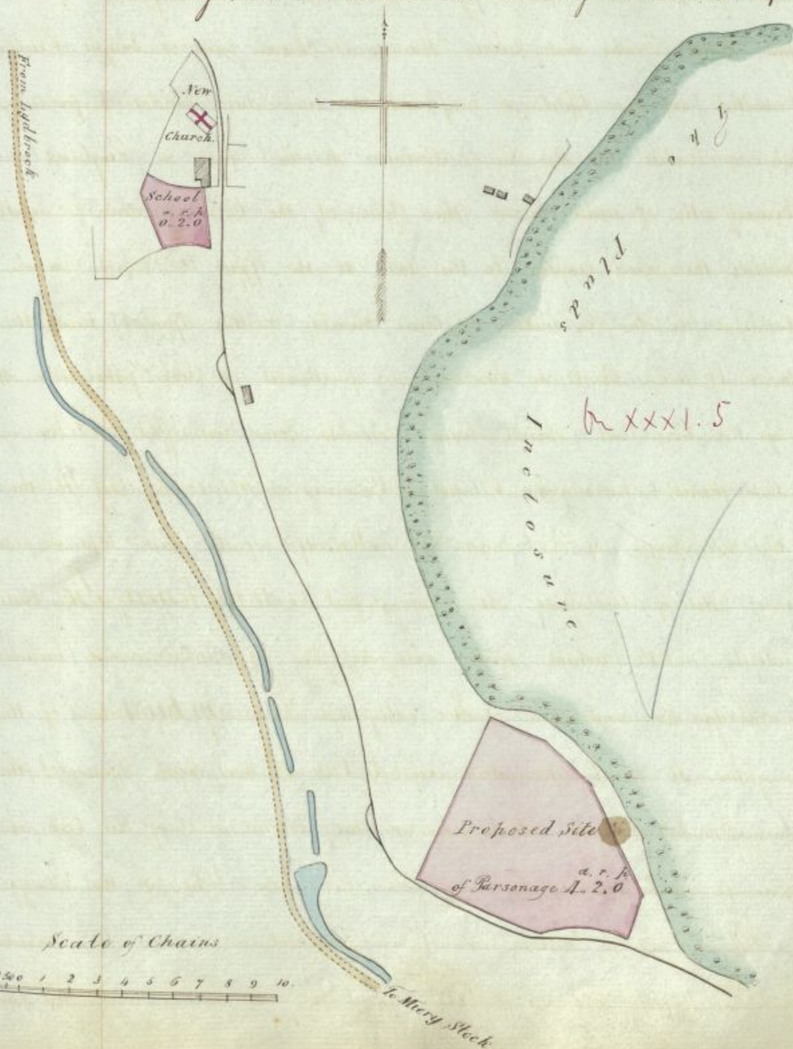
Scale of Chains

Ecclesiastical district of Holy Trinity within the said Forest of Dean and adjoining to the School next the said Church containing by admeasurement half an acre which said pieces or parcels of land are more particularly described in and by the Plan theret drawn in the Margin of these Presents and are thereon colored Red Together with all ways paths passages liberties privileges &c